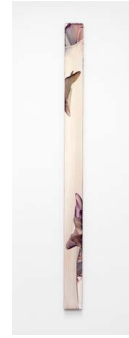
Markus Saile Pipe#40 2024 signed & dated verso oil on wood 200 x 13 cm