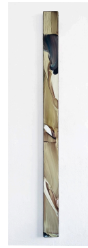
Markus Saile Pipe#45 2024 signed & dated verso oil on wood 200 x 13 cm