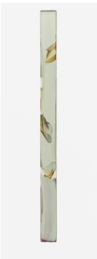
Markus Saile Pipe#38 2023 signed & dated verso oil on wood 190 x 13 cm