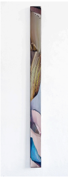
Markus Saile Pipe#47 2024 signed & dated verso oil on wood 200 x 13 cm