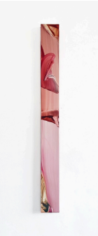
Markus Saile Pipe#48 2024 signed & dated verso oil on wood 137 x 13 cm