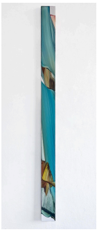
Markus Saile Pipe#46 2024 signed & dated verso oil on wood 200 x 13 cm