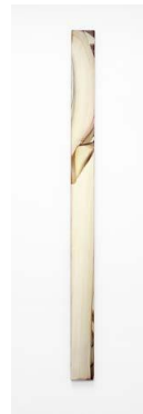
Markus Saile Pipe#43 2024 signed & dated verso oil on wood 200 x 13 cm